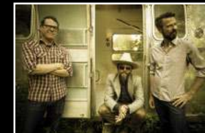
CHATHAM COUNTY LINE 10/30/21 - $35