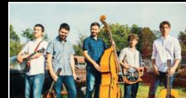
FIRESIDE COLLECTIVE 8/7/21 - $25