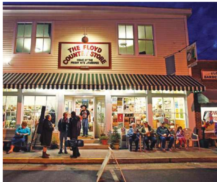
The Floyd Country Store

Floyd Country Store is a renowned place to experience authentic Appalachian music. The store hosts a variety of popular music events including a Friday Night Backyard Jamboree, Sunday Music Jam, and additional programs such as dance lessons. 206 S. Locust St., Floyd, VA; (540) 745-4563; floydcountystore.com At The Rex Theater , catch live bluegrass and old-time music every Friday night during WBRF 98.1 FM's radio show, Blue Ridge Backroads . 113 E. Grayson St., Galax, VA; (276) 236-0329