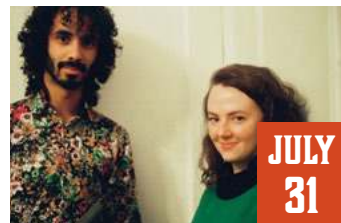
Tui + Dedicated Men of Zion $20