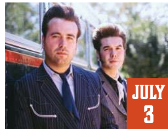
The Malpass Brothers + Redd Volkaert $20