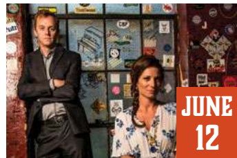
Hank, Pattie & The Current + WSS String Quartet $25