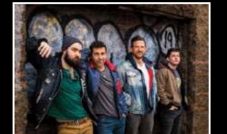
SCYTHIAN 11/13/21 - $30-$35