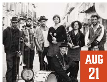
Tuba Skinny $25